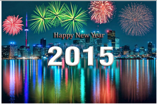
Looking to make a New Year's Resolution? Why not consider making one that is healthy both spiritually and physically!

January is a time where many people make New Year's resolutions. Why not get involved here at Holy Family Parish and share your time, talents, and friendship in one of our many ministries.