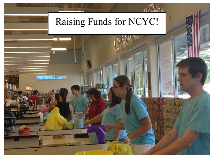
Raising Funds for NCYC!