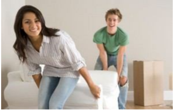
HELP US HELP OUR NEIGHBORS! SIGN UP TODAY AT