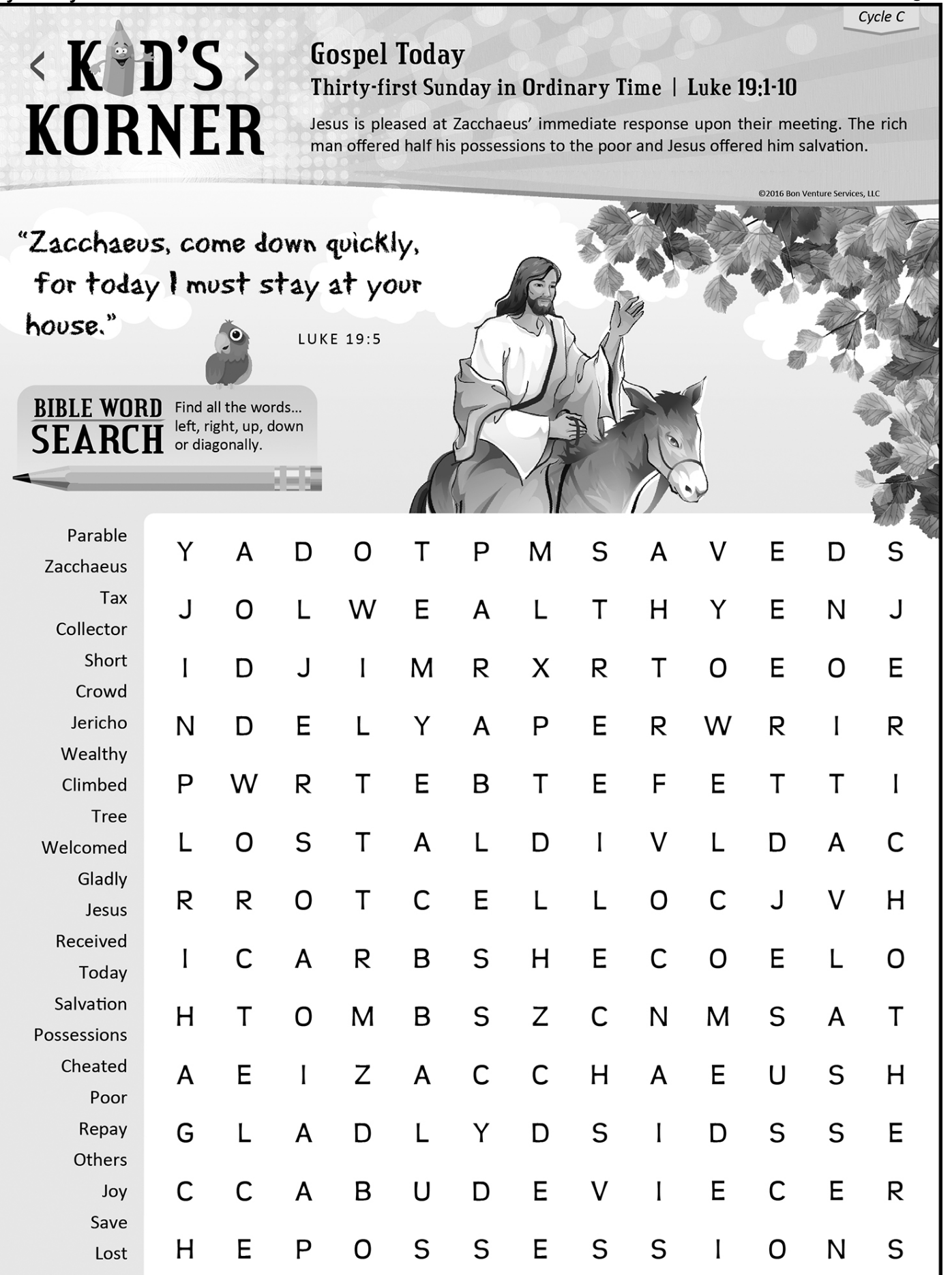
Holy Family Parish