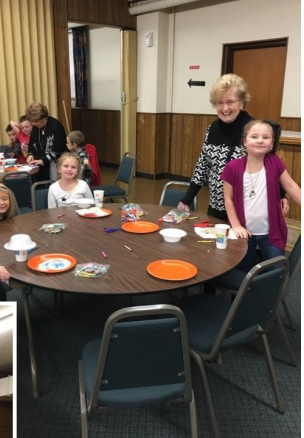
Last Sunday the first grade class enjoyed a session of Pumpkin Fun! The Pumpkin Patch Parable was read to

the students and together they worked on a Pumpkin craft along with their teachers and volunteers.