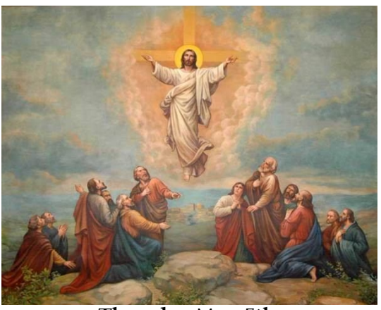
Thursday May 5th The Ascension of our Lord Holy Day of Obligation

This Thursday May 5th is the Ascension of our Lord a holy day of obligation. Masses will be celebrated at 8 a.m., 12 noon, and 7 p.m. Parish Offices will be closed in honor of the Holy Day.