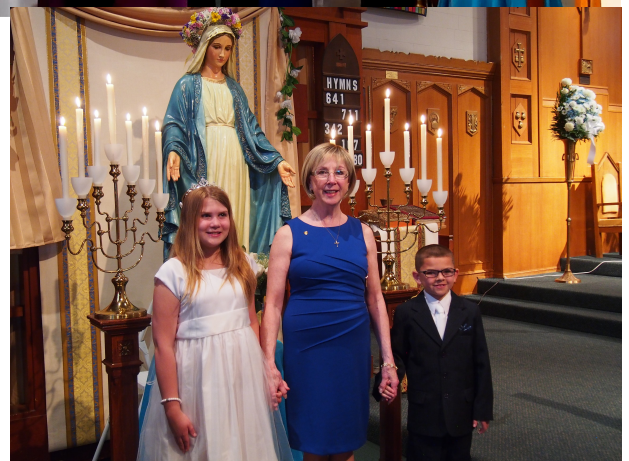
Holy Family Parish honored our Blessed Mother during the May Crowning and Procession at the 11 a.m. Mass on Sunday May 1st.

Our First Holy Communion children participated in the procession along with the Altar & Rosary Society of Holy Family, and the Knights of Columbus, Keyport Council.