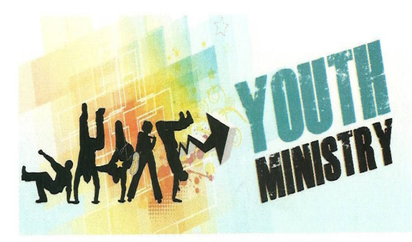
September 2, 2016

Holy Family High School Ministry 727 Highway 36 Union Beach, NJ 07735