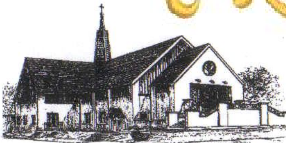
Holy Family Parish Hazlet/Union Beach