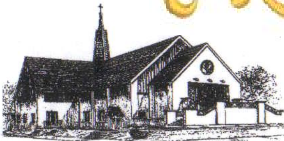
Holy Family Parish Hazlet/Union Beach